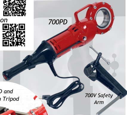
700V Safety Arm