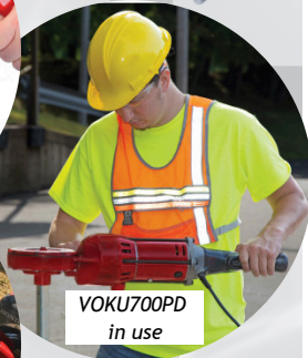
VOKU700PD in use